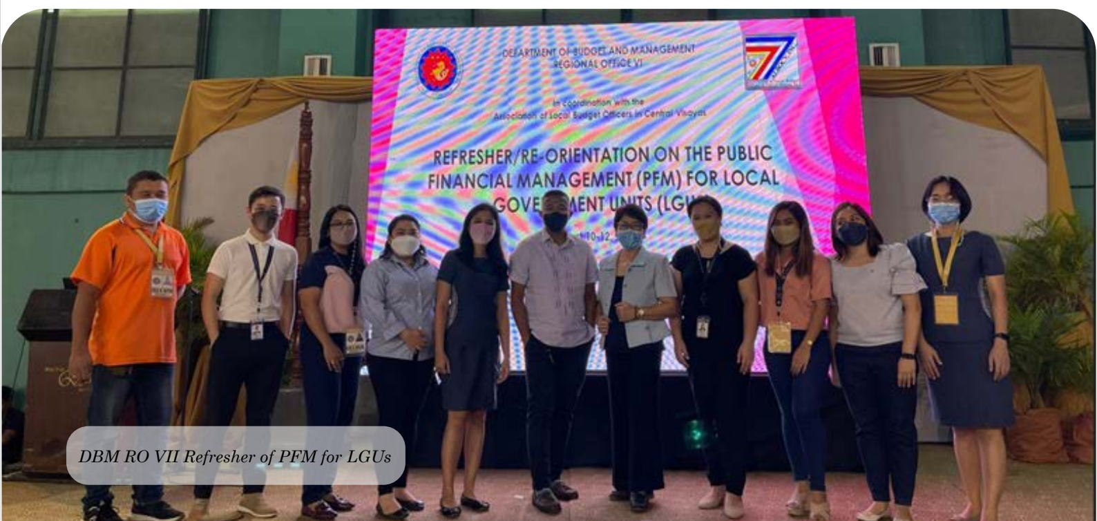
DBM RO VII Refresher of PFM for LGUs