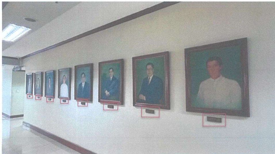
ACTUAL EXISTING NAME PLATES