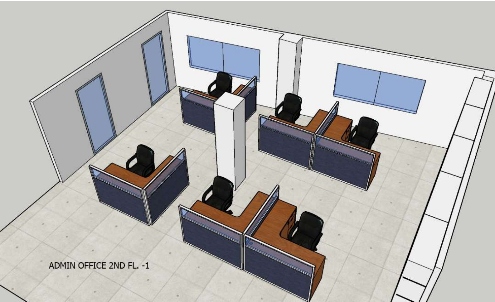
ADMIN OFFICE 2ND FL. -1