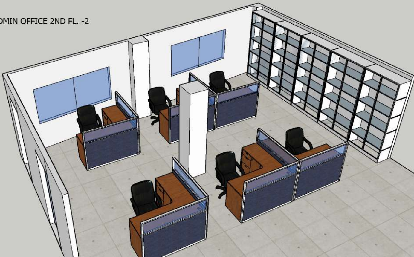
ADMIN OFFICE 2ND FL. -2