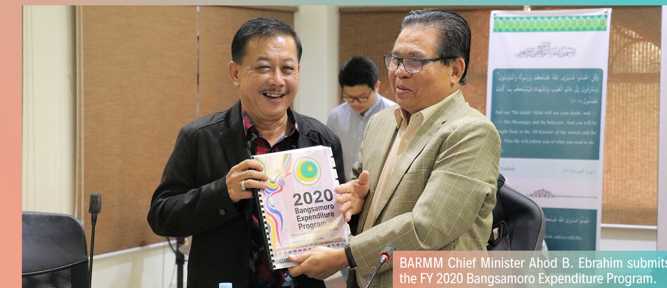
BARMM Chief Minister Ahod B. Ebrahim submits the FY 2020 Bangsamoro Expenditure Program.