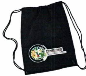
DRAW STRING BAG