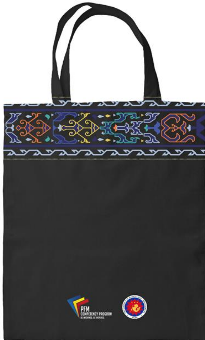
A. Canvas Tote Bag