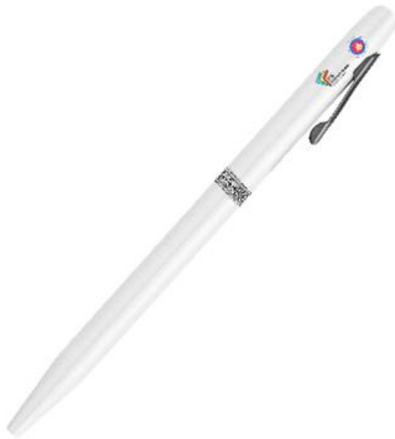
B. Retractable Ballpoint Pen